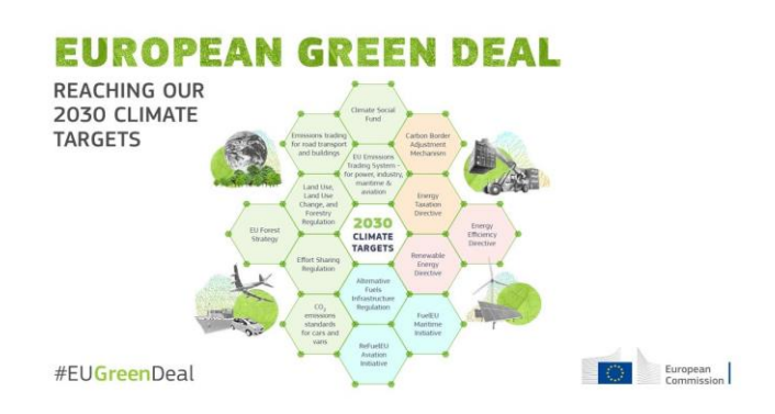
Fit for 55 legislative package